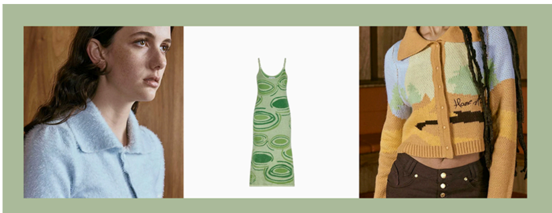
House of Sunny range 2020, www.houseofsunny.co.uk