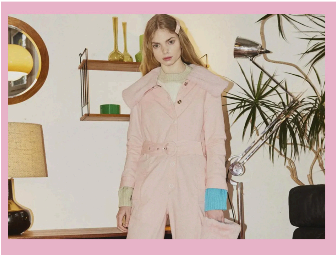
House of Sunny coat, House Of Sunny 2019.

(Please note House of Sunny is abbreviated throughout this case study to HoS)