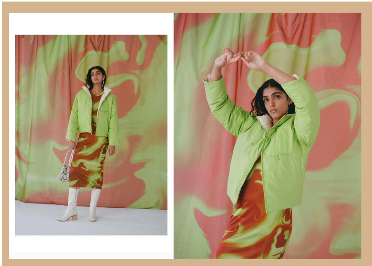
Paloma Wool 2019 range, via monkhousedesign.com

unlike HoS which are transparent in their fabrics used. Paloma Wool's price point sits a little bit higher than HoS, yet they both share a similar aesthetic in design, prints and colourways.