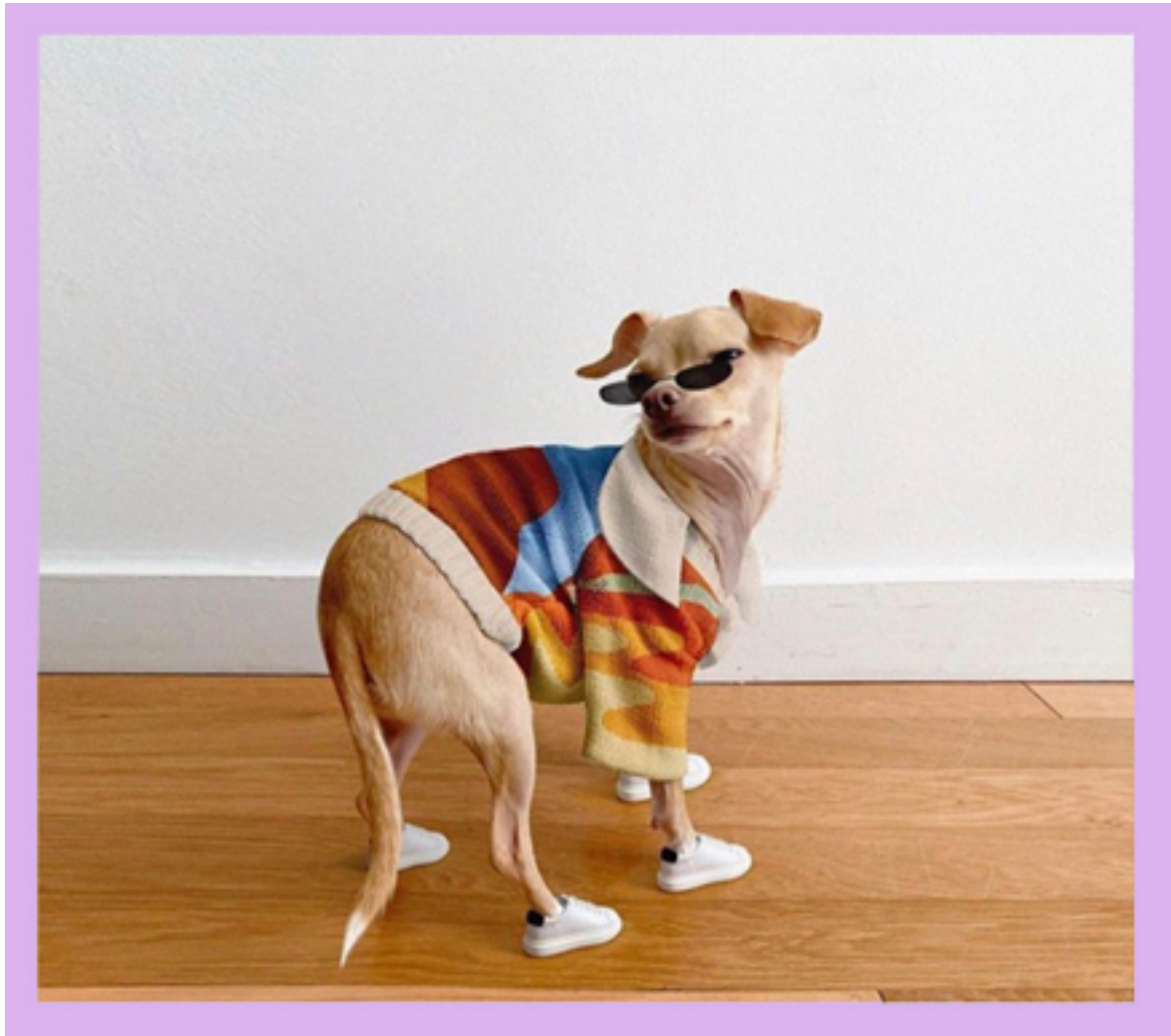
@boobie_billie the doggo approves of HoS, wearing the Day Tripper cardi, www.instagram.com/houseofsunny , 2020

transparent in their supply and production chain, forcing them to be more considerate in their choices by paying fair wages and only investing in those factories that offer a safe working environment for their employees. Resulting in a kinder, more aware, environmentally conscious brand identity and conscious.