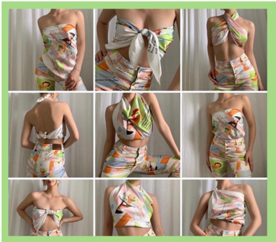
HoS anti print scarf top, @houseofsunny 2019 Instagram

cheaper non-sustainable product would result in a more significant profit. Customer may be put off by the price tag attached to HoS products and opt for something more affordable and faster. Due to pre-orders, customers are forced to be a bit more patient in waiting for their piece if it isn't yet released. Customers may be turned off by the waiting period if there is an urgency for the item. Without a physical store, potential buyers are unable to feel and try on items, considering the price tags on HoS clothing and wait time it is a bit of a gamble for the purchaser to take on an item if the fit and feel of the garment are right for them.