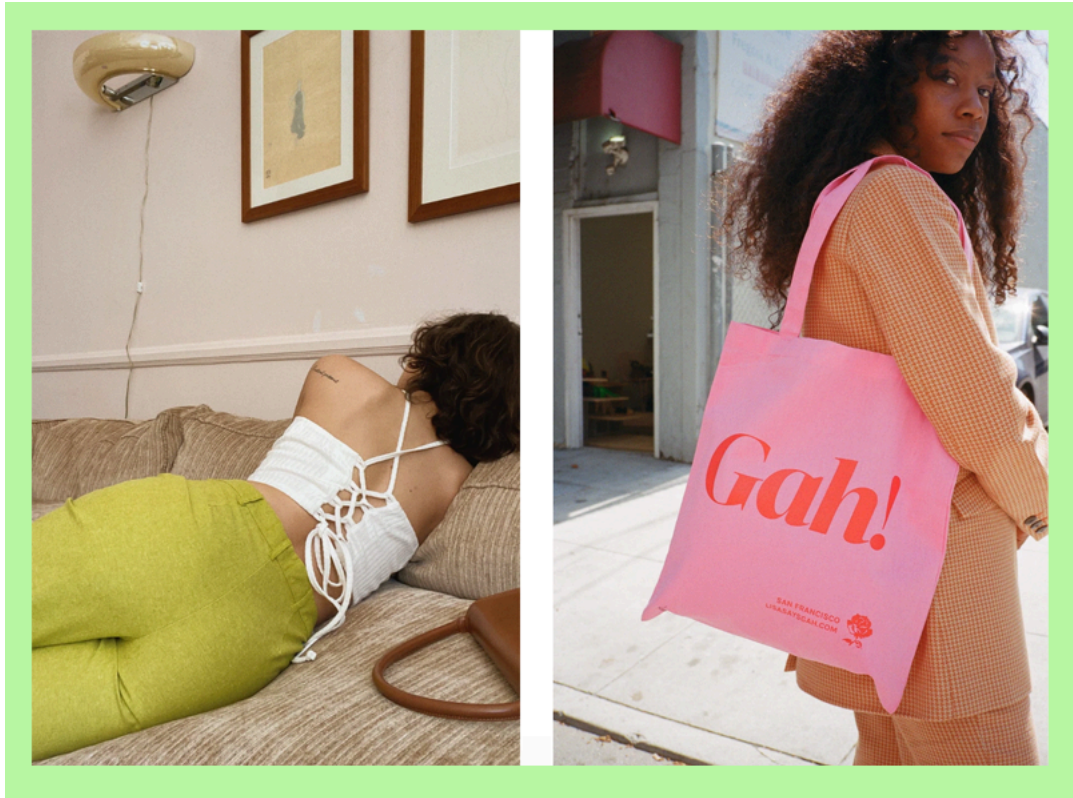
Lisa Says Gah 2020 range, www.lisasaysgah.com

Another of HoS's significant competitors is Barcelona based brand Paloma Wool. Like HoS Paloma Wool also runs against the norm of seasonal releases. "...the brand (Paloma Wool) operates outside of the seasons of the fashion industry by gradually releasing timeless pieces throughout the year." (Garmentory,2020) Paloma Wool design and produced their stock locally in Barcelona and across Spain to reduce their carbon footprint and support local factories and designers. Paloma Wool tackle overconsumption by only running limited runs of their pieces, and once the item is sold out, it does not go back into production. The only public information shared by Paloma Wool is that their articles are designed and produced locally, there is no mention of what fibres or if any synthetic materials are used in production,